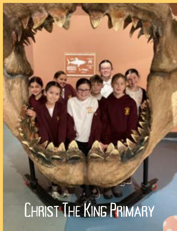
CHRIST THE KING PRIMARY